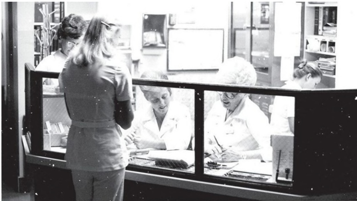
Nurses are shown at work in the news hospital.

It offers a variety of health services to care for the Mariposa community: Acute patient care, bone density, cardiopulmonary, CT scan, education, Ewing Wing, home, health and hospice, imaging (bone density, digital mammography, ultrasound, CT), laboratory, MRI, respiratory therapy, Ryan White AIDS/HIV program, social services, surgery (outpatient) and ultrasound.