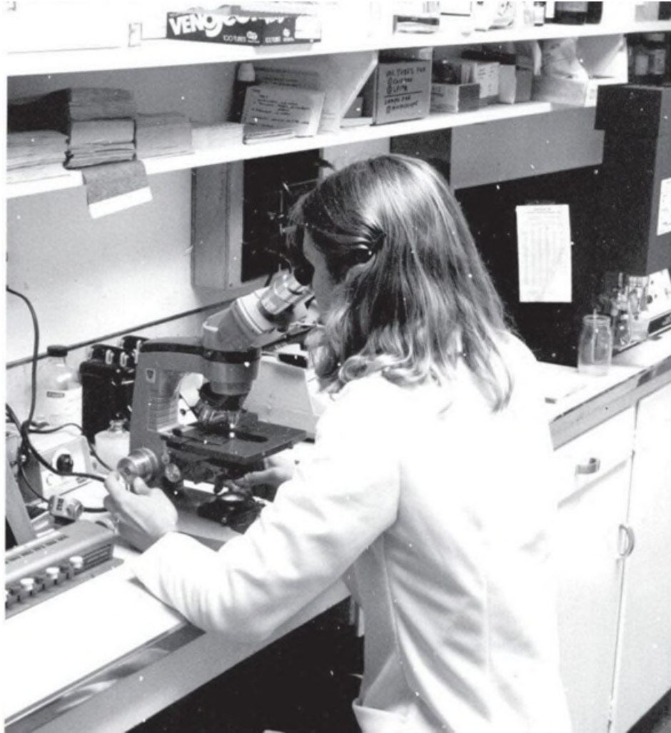
This photo shows a technician working in the lab of the new hospital.

With this service, hospital officials said they have reduced emergency response times by 25 minutes. The air ambulance helicopter service transported 337 patients last year.