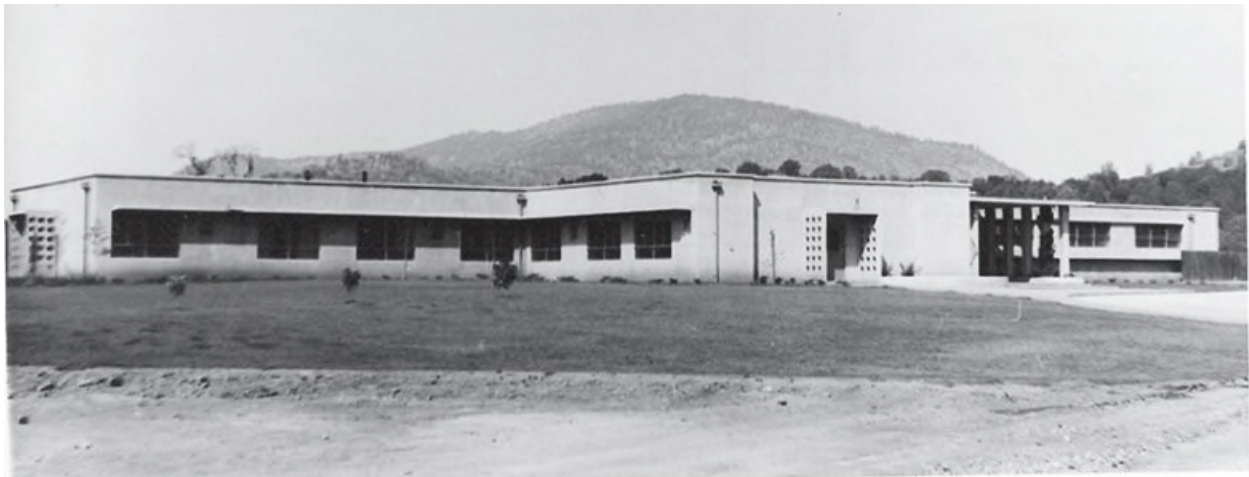
This is a photo of the hospital taken after construction was completed.